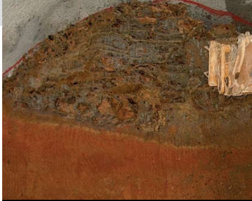
Machinery cuts into volcanic flow rock, which lays above red-orange tuff.

When you walk into Arkenstone's cave from its main working portal, you enter one of the most utilitarian and hardworking areas of the cave, yet the experience is almost as breathtaking as descending through the Hobbit Hole onto the mezzanine. You enter a 16-foot wide arched cave and immediately have