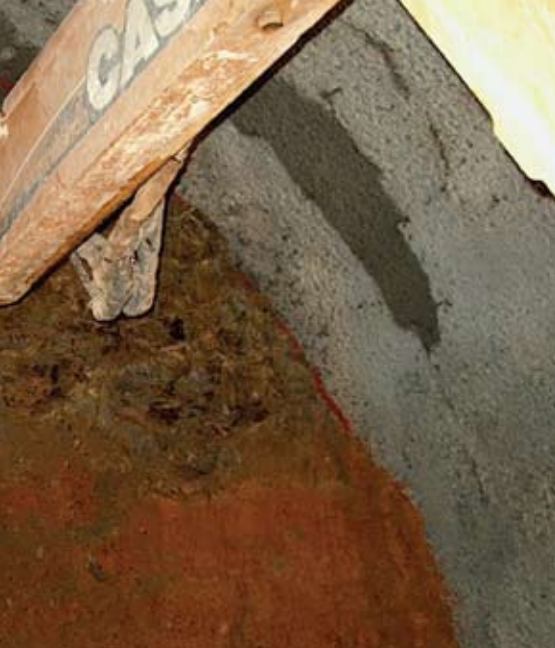
The gray outside is shotcrete support.