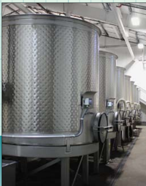
Westec’s New Tank Jackets can be built for any size tank, including our portable tanks.